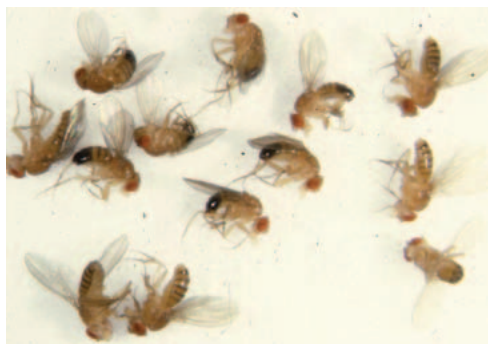
Figure 2. Fruit Flies

Step 1 Using fruit fly cultures, carefully toss 10 to 20 living flies into an empty vial. Be sure to plug the vial as soon as you add the flies. Do not anesthetize the flies before this or any of the behavior experiments.