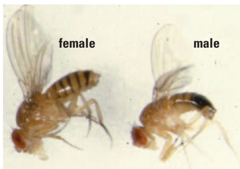
Figure 1. Determining the Sex of Fruit Flies

This procedure is designed to help you understand how to work with fruit flies. You may start with general information about how to determine the sex of a fruit fly. How do you tell the difference between male and female flies? Is the sex of the fly important to your investigations? Look at the female and male fruit flies in Figure 1. Then look at the fruit flies in Figure 2. Can you identify which ones are female and which ones are male? Focus on the abdomen of the flies to note differences.